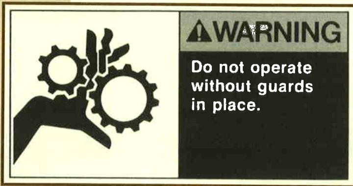
Example of a warning sign.

There are roughly four broad steps that should be taken by a manufacturer of products, to ensure their product is safe once it reaches the production stage and is available to the consumer.