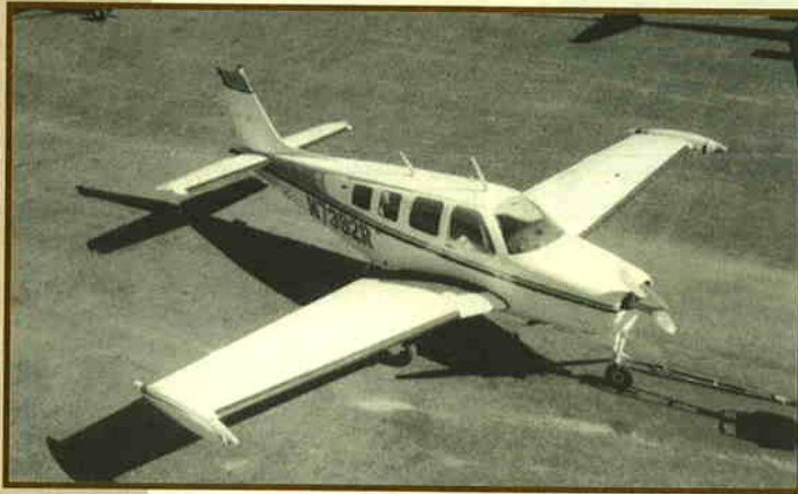
SEAL's Beechcraft Bonanza A36.

SEAL Corporation 12785 State Hwy. 64E Tyler, TX 75707-5933 Tel: 903.566.1980 Fax: 903.566.4504 seal@tyler.net sealcorp.com